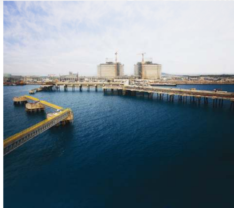
<Thailand, PTT LNG Project>